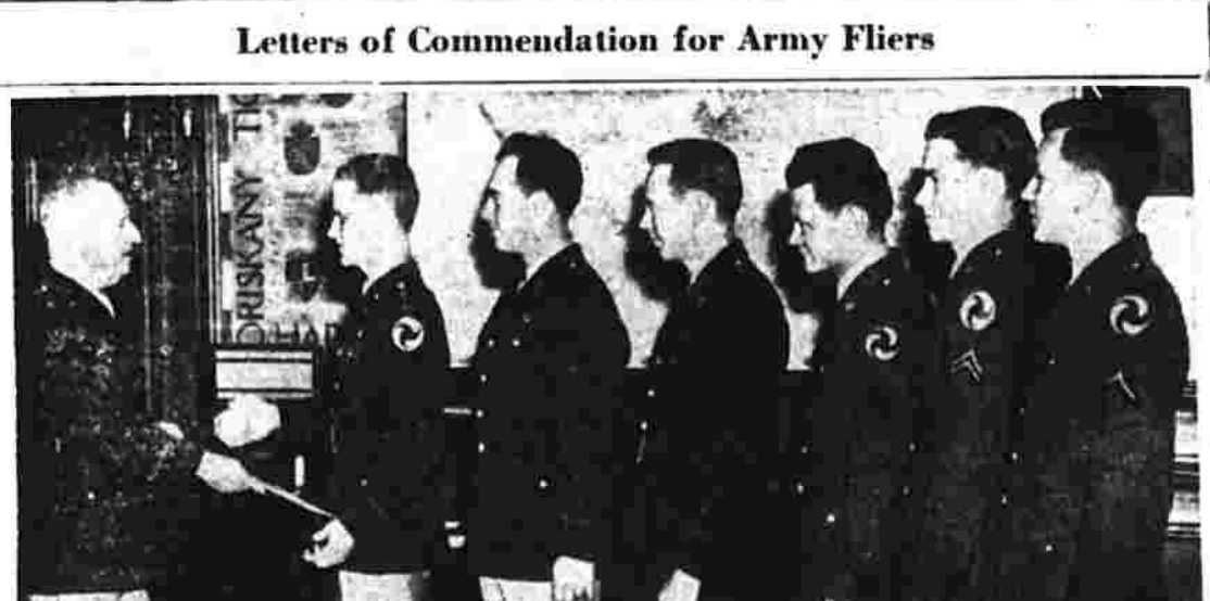
Letters of Commendation for Army Flyers

Letters of Commendation for Army Flyers... German Losses of Big Battleships As Repairs Needed